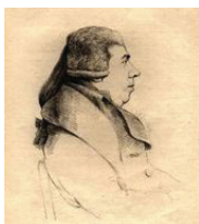
Samuel ARNOLD 1740-1802