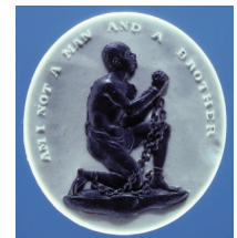
WEDGWOOD anti-slavery plaque