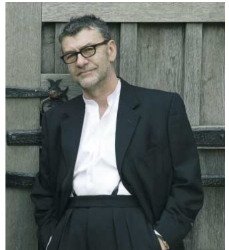
Jack Vettriano.

to which I would like to contribute." Jack has accepted Honorary Membership of the College which will be conferred in November when he comes to Cambridge.